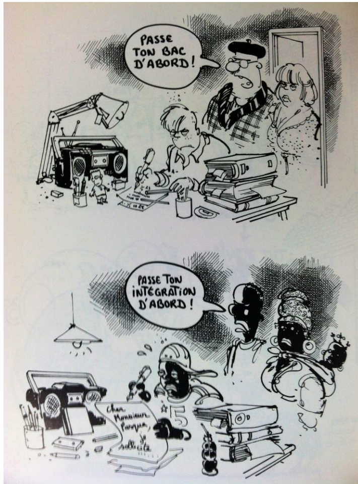
Figure 2: “Passe ton..!” by Plantu. Originally featured in Le Monde and later published in the collection, Le Petit Raciste Illustré , Éditions du Seuil, 1995.

The reforms proposed by the Chalandon bill would not strip second-generation immigrants of their access to French citizenship, but would instead make the acquisition of French nationality dependent on a ‘prior act of will,’ so as to “avoid integrating persons who don’t really want to be” French. 39 In fact, this version of the proposed reforms was already a complete departure from earlier proposals, which had unabashedly intended to restrict access to French citizenship rather than simply modify the process of acquisition. Nevertheless, this eventually became the general premise of the debate, and